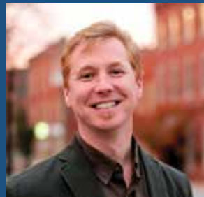
from the EDITOR

I'm not sure what I expected, to be honest. I had never really given much thought to this tiny island that is just