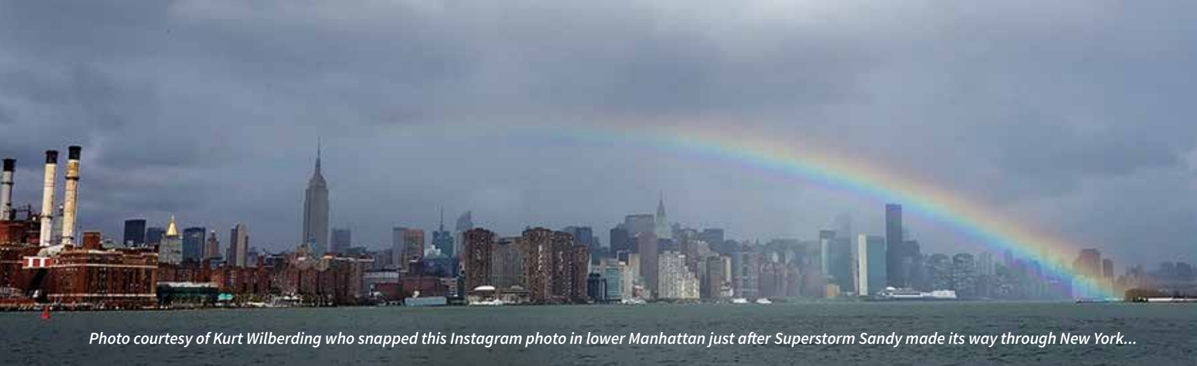
who snapped this Instagram photo in lower Manhattan just after Superstorm Sandy made its way through New York...