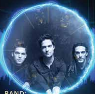
BAND: ABOUT A MILE