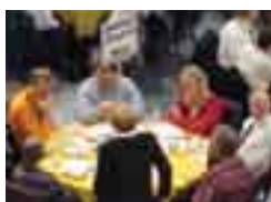
Messengers and guests enjoy a delicious meal prepared by Disaster Relief volunteers.