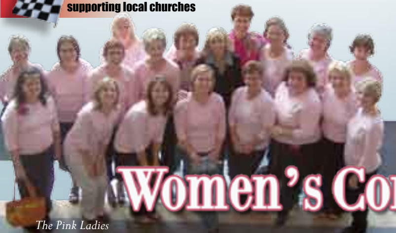
The Pink Ladies