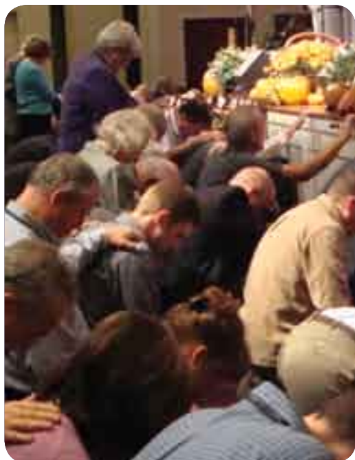
Many are compelled to the altar to kneel before God in prayer.