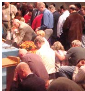
Attendees move to the altar to "nail their convictions to the cross."

The 12 th annual SBCV Homecoming took place on November 10 and 11 at First Baptist Church, Roanoke. The theme, "Pushing Back the Darkness through Prayer," was based on Isaiah 56:7.