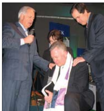
Prayer for the SBCV's new executive director-treasurer