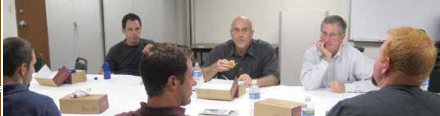
CP Mentoring Mtg at Grove Avenue