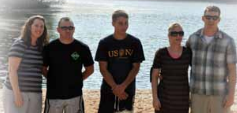
Recent lake baptism, where Pillar Church baptized two marines, their wives, and a Naval Academy student

Consider: How can God use you to touch a life?