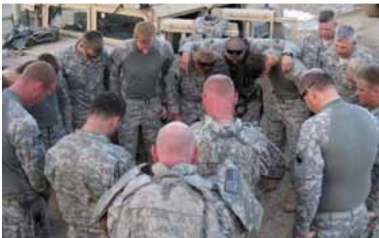
1-116TH Infantry, recipients of VA Soldier R & R Kits, in prayer