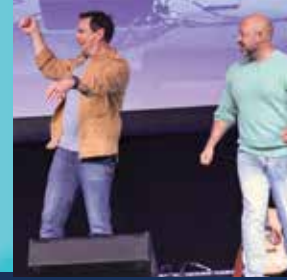
The Skit Guys Special Guests