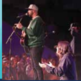
The Museum Worship Leaders