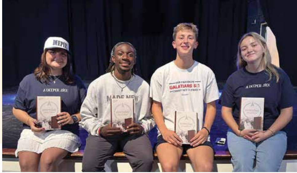
Students display their newly received CSB Everyday Student Bibles.

When the Word of God is placed in open hands and open hearts, transformation follows.